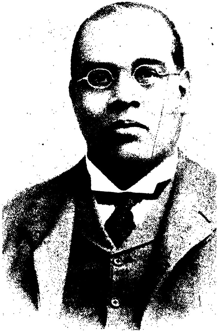
Romesh Chunder Dutt